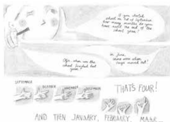
Figure 1: Example of primary internal ocularization

I will apply these definitions to the examples from my own artistic practice and try to see to what extent my book is adhering to the aforementioned definitions. In the book, I rarely used “primary internal ocularization”, and the example can be seen in Figure 1. In this example, I use “primary internal ocularization” quite literally. My main character needs to calculate months until the school-break and uses her hands to do it, which helps the reader to believe that it is the character’s field of vision.