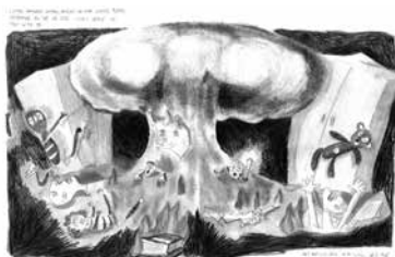
Figure 3: Example of modalized ocularization

The element that I used very often is the mental picture. In Figure 3, one of the first mental images is shown. Together with the text, the image works to assure the reader that he sees a mental picture of the main character. Literally, the text accompanying the image says that the imagination of the girl is presented. Depicted elements that do not exist in the “real” world confirm that this is not a real event; therefore the reader sees a fantasy.