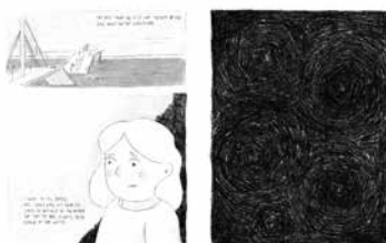
Figure 6: Example of modalized ocularization