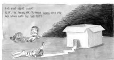
Figure 4: Example of modalized ocularization

In Figures 4, 5 and 6, the same rules apply. The elements depicted are not possible in the “real” world, and the text suggests that the panel illustrates the character’s thoughts.