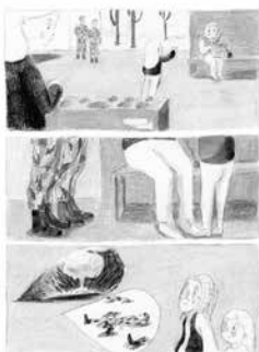
Figure 2: Example of secondary internal ocularization

If considered in relation to the sequence, this example could as well be an example of “secondary internal ocularization”, since the whole comic “syntax” is built up to help the reader believe that the visual subjectivity of the character is shown. The “secondary internal ocularization” can be seen in Figure 2. In the first panel, the main character is in the same space as the rest of the characters. In the context of the sequence, the next panel can be assumed to be a subjective point of view.